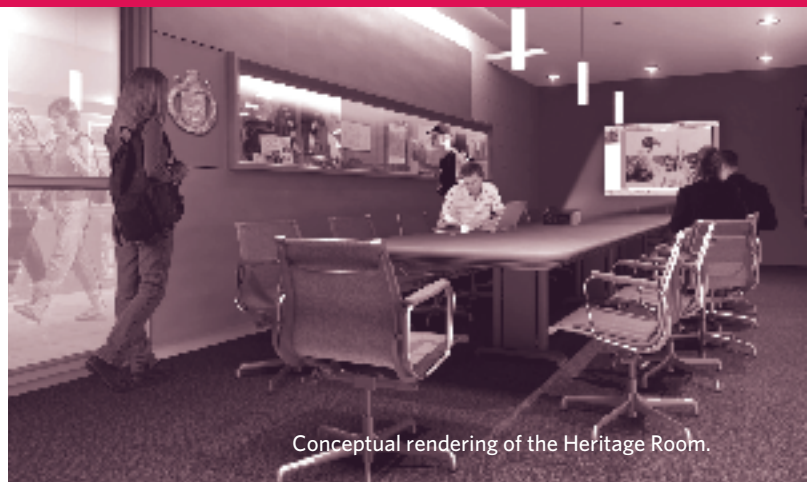
Conceptual rendering of the Heritage Room.