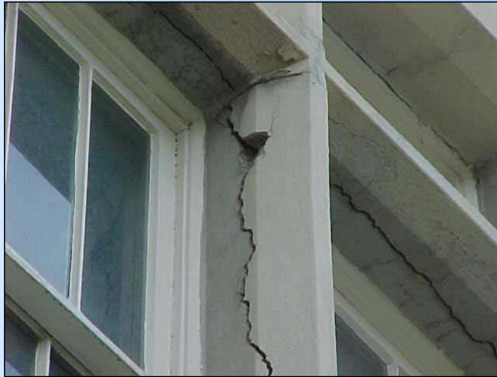
Examples of Precast Concrete Deterioration