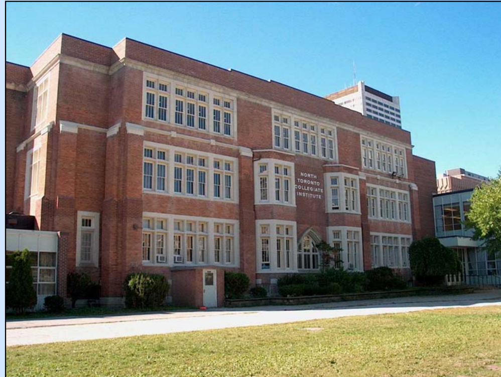
North Elevation Post Repairs