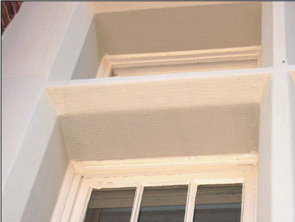
Post repair detail