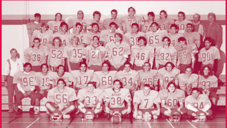
North Toronto Varsity Norsemen — 1993 T.S.S.A.A. Tier 3 Champions

While the list is far from complete, here is a small sample of some of the great athletes who have passed through the doors of NT.